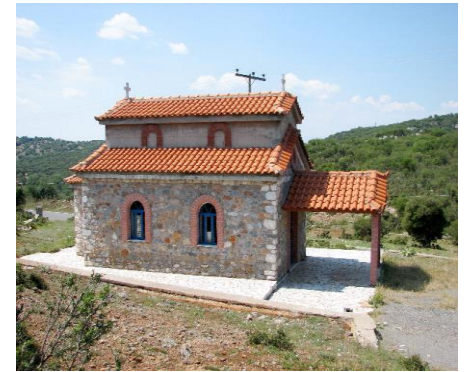
The Saints Taxiarches chapel