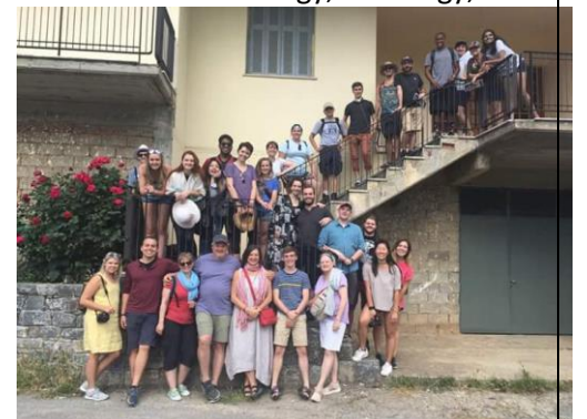
At the Stathakis House

To conclude, no one wants to leave the village when the sun sets and it is time to continue our journey. At the end of the trip, I ask the students to tell me what their favorite part was – most of them do not hesitate to respond "THE VILLAGE!"