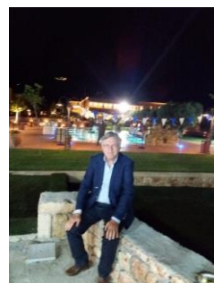
The President of S.A.K. at the inauguration

The inauguration was followed by a reception in the gardens and the pool of the hotel, where the guests had the opportunity to walk across and see the spaces of the hotel, which apart from the amazing rooms include two restaurants, a reception hall, a wine bar, four tennis courts, two swimming pools, a spa, a café, shops with local products and a hair salon. It is important to note that the Mystras Grand Palace Resort & Spa hotel is the first five-star hotel in Laconia.